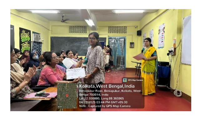
Participant receiving certificate from Principal