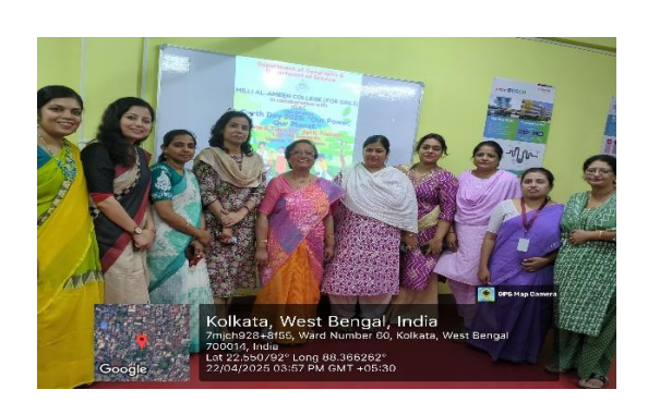
Principal with the faculties