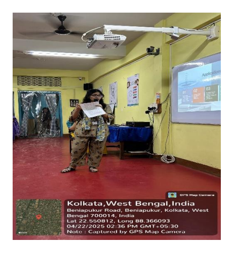
Students giving presentation.