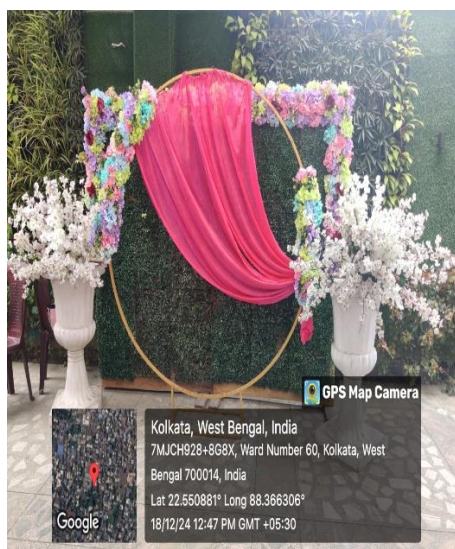
Selfie Corner outside auditorium