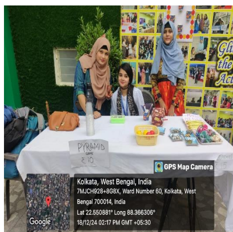
Gaming zone outside auditorium