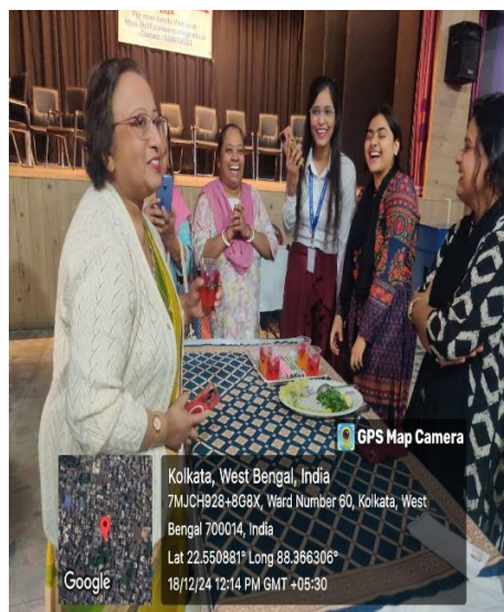
Principal motivating the students