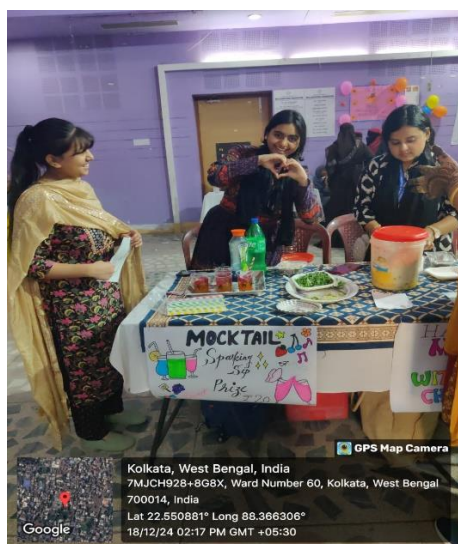
Students and visitors at food stall