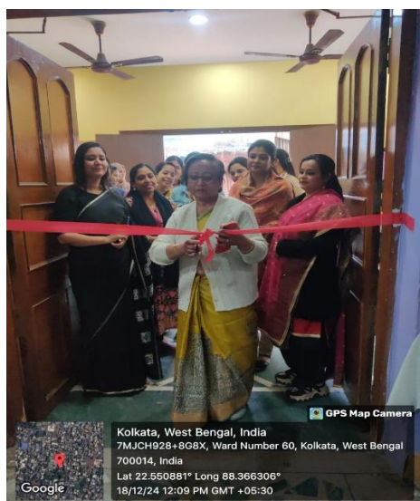
Inauguration by Principal