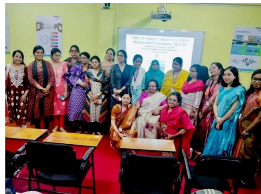
Principal and all the teaching faculties.