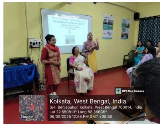
Principal introducing the Departmental faculties to the new students