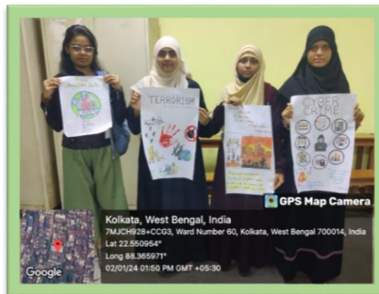
Students participating in the poster making competition