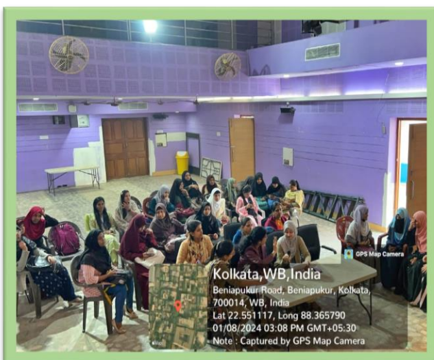
Students participating in the Quiz competition