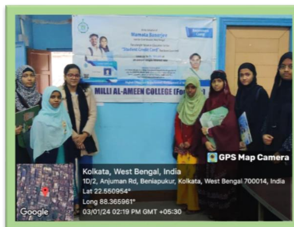
Awareness programme for the students regarding various West Bengal Government Schemes