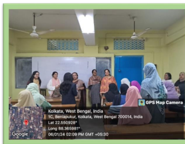
Students participating in the creative writing competition