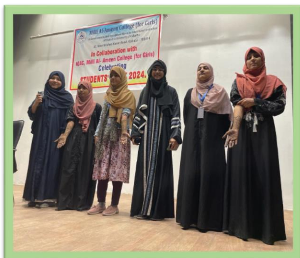
Students participating in the food and mehndi competition